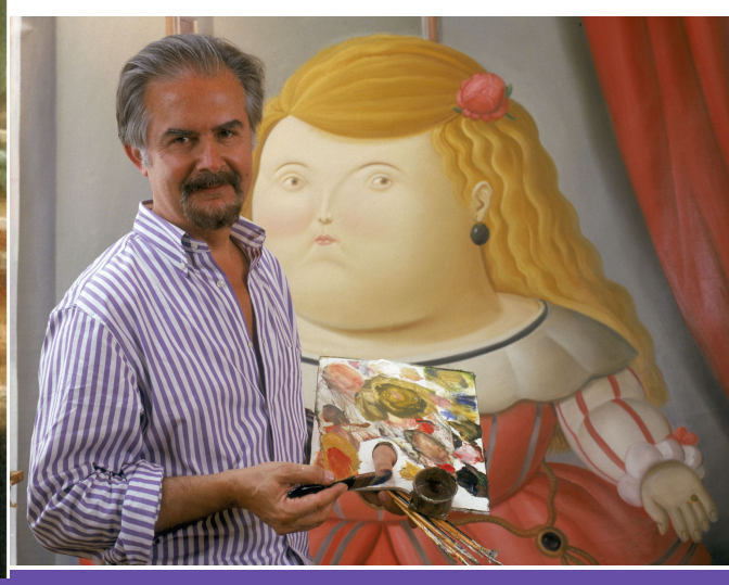
Una Lección de Fernando Botero 1932 - present